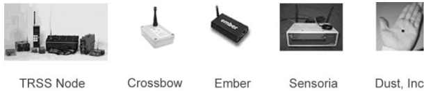
Fig. 2. Three generations of sensor nodes.

shaped like a maple tree seed and dropped to float to the ground. A wireless network of these ubiquitous, low-cost, disposable microsensors can provide close-in sensing capabilities in many novel applications (as discussed in Section IV).